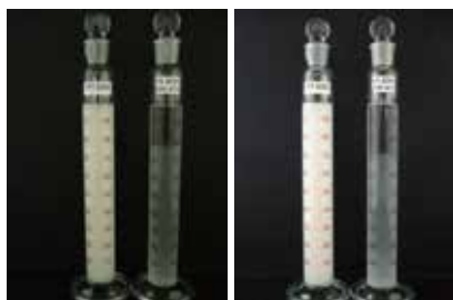
MT-2350 matt silica

Traditional matt paint formulated with silica is easily settled to the bottom after diluting to spray viscosity. By using Hypomer MT-2350 , the matt paint will give better suspension performance under identical condition.