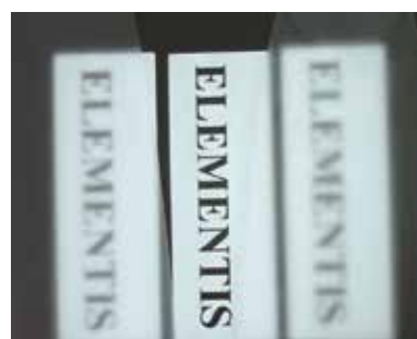
Matt clear coat with Hypomer MT-2350

The following picture compares transparency of two coating films made formulated with Hypomer MT-2350 and matt silica respectively. Paint film with Hypomer MT-2350 shows clearer background pattern, which means the better of transparency.